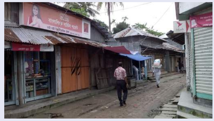
Gazipur Bandar, Bazaar.

Gazipur, with a population of 2.1 million, is located north of Dhaka and currently is the most dominant industrial area in Bangladesh. Rapid urbanization has outpaced infrastructure services, including for waste management. Textile factories, hospitals, and residents dump large volumes of toxic and infectious waste indiscriminately in illegally dump sites. Waste frequently clogs open drains, contributing to urban inundation, as well asoverflowing pit latrines and septic tank systems after heavy rain. As a result, Gazipur faces elevated risks from water-sanitation related diseases, especially amongst the most vulnerable residents.