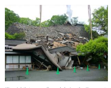
Kita-eighth tower collapsed during the Kumamoto earthquake.

The figures in this segment signify that natural disasters, including those exacerbated by climate change, continue to have menacing impacts for communities around the globe. In the Global South, these events can have a particularly devastating and lasting impact, setting back the development progress and compromising the wellbeing of present and future generations. This was best evidenced by the varied impacts of Hurricane Matthew in the USA -where it bore significant USD costs- and one of the poorest countries in the world, Haiti -where it led to large loss of life. The integrated approach to development and resilience enshrined in the SDGs, Sendai Framework, and Paris Agreement reflects these considerations and strives to anticipate a world where human safety, resilience, and wellbeing are part of one unified global priority. Cities and regions actively support this vision as the impact of disasters and long term stresses are often felt most directly in urban areas. Adapting an integrated approach to resilience and sustainability helps reduce avoidable losses and damages.