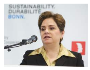
Patricia Espinosa, Executive Secretary, UNFCCC and Co- Patron of Resilient Cities 2017.

What remains is to bring the pieces together, by strengthening cooperation between and amongst sectors and governments at all levels that is underpinned by inclusive, transparent governance mechanisms.