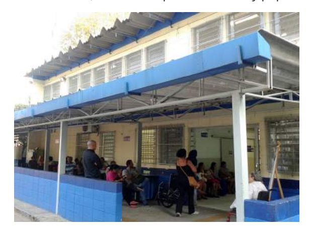
Ambulatory Medical Care (UBS / AMA) of Vila Nova Jaguaré, São Paulo, SP, Brazil.

Climate change is expected to exacerbate existing health problems, by disrupting water and food supplies for example, while creating new challenges including increased exposure to disease vectors, water borne diseases, undernutrition, and air pollution (IPCC, 2014). The World Health Organization (WHO, 2014) estimates it will cause approximately 250,000 additional deaths per year between 2030 and 2050 mainly due to diarrhea, malaria, childhood undernutrition, and heat exposure of elderly populations.