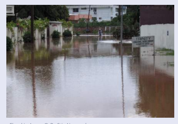
Flood in Accra.

The GAMA is prone to coastal and surface inundation, as well as related water and vector-borne disease epidemics. Rapid urbanization combined with poor spatial, water and sanitation, and solid waste management compound this vulnerability, resulting in high annual flood risk.