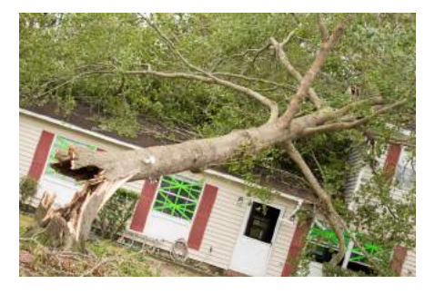
Hurricane Mathew knocked out electricity, left behind flooded areas and downed trees.