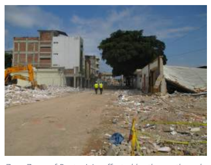
Zero Zone of Portoviejo affected by the earthquake in Quito, Ecuador.