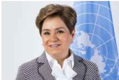
Patricia Espinosa , Executive Secretary of United Nations Climate Change